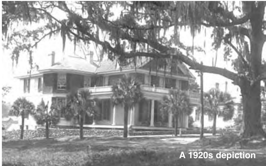
The Inn at Park Avenue

Madison's appeal lies not only in its beauty, lush surroundings and photographic antebellum and Victorian homes, many 200-years-old, which dot the quiet streets, but in the friendliness of its people. "What can you do if you live in a big city?" asks Madison's public relations people, then answers, "We suggest you adopt our small town!" Madison's appeal to wedding planners is world wide