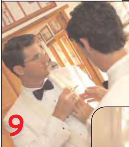
PHOTOGRAPHY Cover: The Aquarium, and Best Man, left, cour- tesy: tomasramos.com