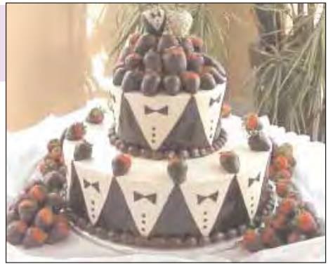
The Groom's cake always adds to the dessert table. Groom's Tux Cake by The Cake Guys, Dallas, Texas www.thecakeguys.com .

Once you've decided on where your reception will be held and how many people you are inviting, the next steps are to create food and beverage menus, pick out your wedding cake, create your seating plan, plan your receiving line, shop for entertainment, decorations and other accessories, decide if you want to budget for other services such as security, and appoint a volunteer to represent you at your reception site to help coordinate the activities in setting up your requirements. - G